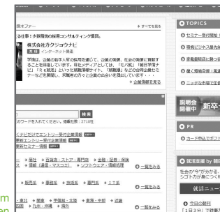
Company application form entry confirmation screen

Check the entered information on the confirmation screen and click "Submit" to complete the process.