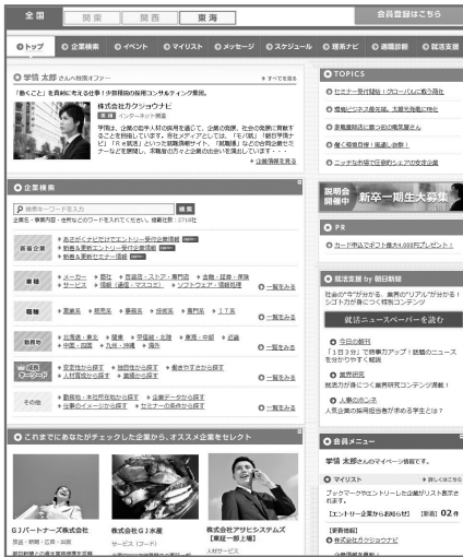
Company details screen

Register as a member of an employment support website. To register for membership, you must provide your personal information.