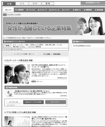
Company search results screen

Once you have registered as a member of an employment support website, you can apply to companies for jobs. Search for companies that you are interested in and then apply for jobs that they are offering.