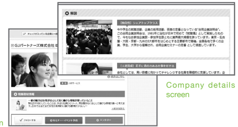
Company search results screen

Click "Application" on the company search results screen or the company details screen.